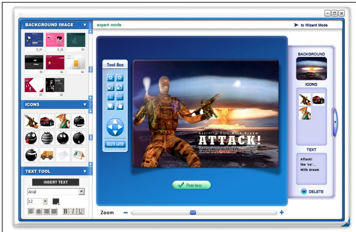
Figure 1: The Custom Graphic Unit (CGU) Module

PowerIcon marketer can customize CGU (a Web 2.0 client application) to include their own graphics, designs, products, events or services. Customization features include the ability to choose from a selection of background images provided by PowerIcon 's designers, your designers or end customer. The CGU also has the ability to add custom text with full control of font and color selection. Once the design is complete and the order is placed, the customization specifications along with the design will be forwarded to one of many manufacturing/printing vendors through the PDU.